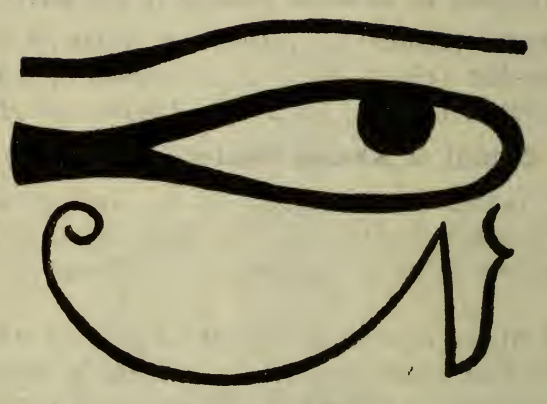
The Eye of Osiris