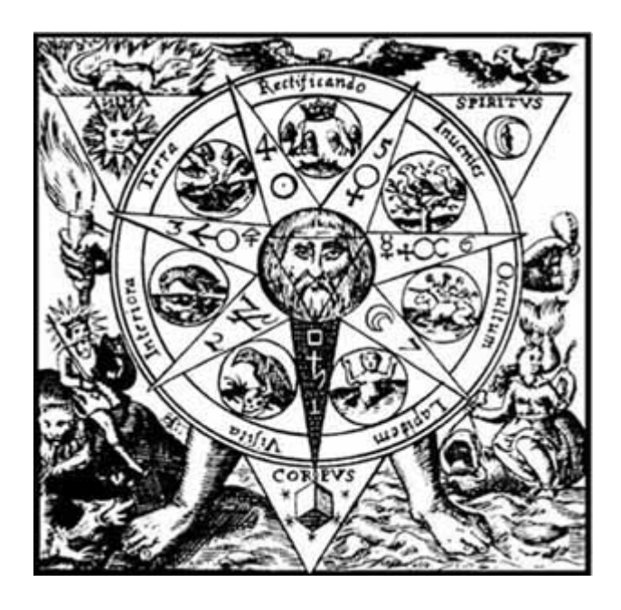
called the Azoth of the Philosophers

Working only with these early translations, many seekers of truth recognized in subsequent centuries that the Emerald Tablet contained a secret formula for transforming reality. Many alchemical drawings such as this one